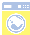
Institutional and Laundry