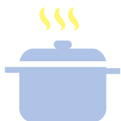
Food and Beverage

We serve institutional and industrial end-users such as food service providers, lodging establishments, food and beverage processing plants, building service contractors, retail outlets and health-care facilities. We provide products directly to your doorstep and have a large fleet of delivery vehicles ensuring a fast and efficient service. We work with our customers to ensure operational efficiency, safety, sustainability, and product quality, resulting in customer satisfaction.